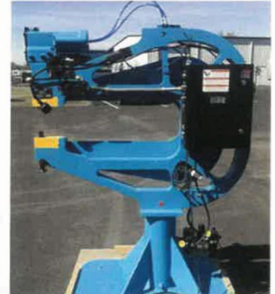
We were able to shave off over 1000lbs from this pneumatic press with Waterjet CNC so it could be installed on the third floor in a manufacturing facility! We solve unique problems on a regular basis at JetPoint Technologies Inc!